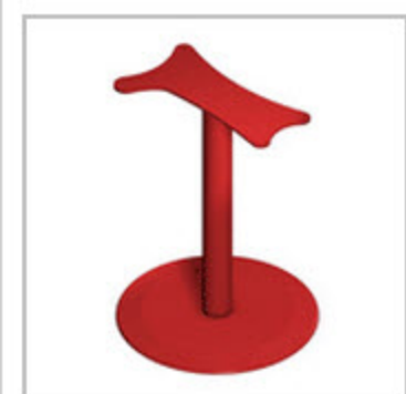
Optional red stand