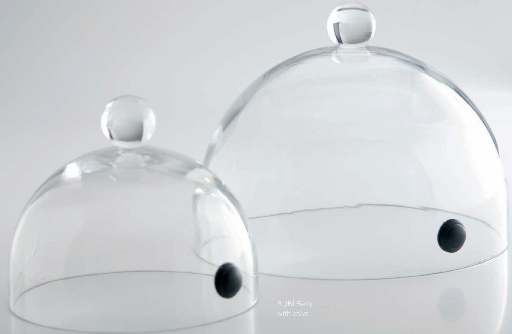
RUBÍ Bells with valve